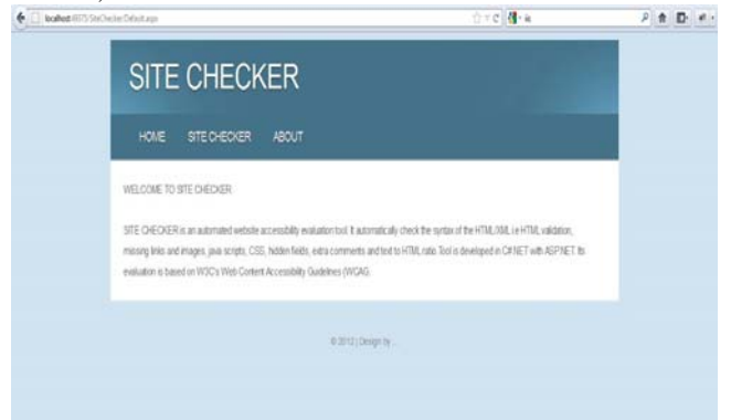
Figure 3 SITE CHECKER home page

There are three links on the evaluation tool's window: HOME, SITE CHECKER and ABOUT.