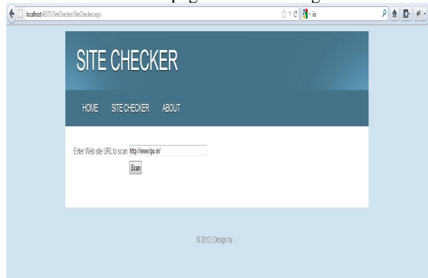
Figure 4 SITE CHECKER evaluation page

gives the brief introductions about the functions of the tool. Next page is SITE CHECKER. This is the actual page which evaluates the websites. When we click on SITE CHECKER link on the home page this page will be opened. It includes a text box for entering the URL of the website which we want to evaluate and a scan button. Put URL on text button and click on scan button for evaluation. After evaluating each page of the website, a list of evaluation report will be generated and display on the screen. Window of this page is shown in figure 4.