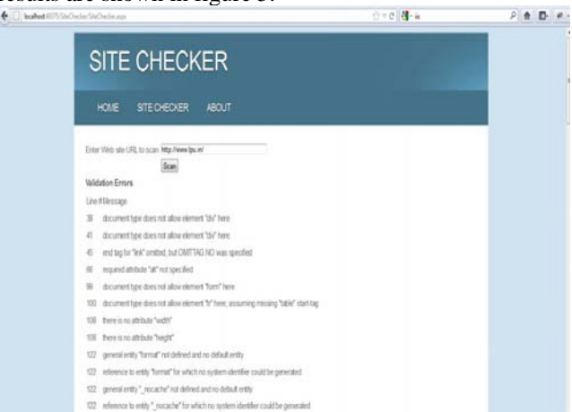
Figure 5 List of evaluation results in site www.lpu.in

When we click on scan window, it starts evaluating the site. Then a list of errors is displayed along with line number and description. E.g. when we enter the URL ww.lpu.in results are shown in figure 5.