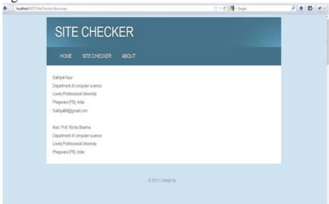
Figure 6 ABOUT page of the tool window

Next page is ABOUT in the tool window. This is shown in figure 6.